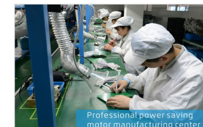
Professional power saving motor manufacturing center