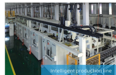
Intelligent production line