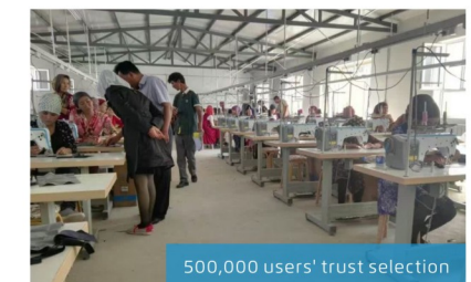
500,000 users' trust selection